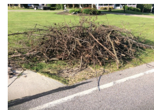
Improper branch placement at the road