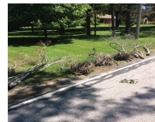
Proper branch placement at the road

If a yard project is larger than what the homeowner can do themselves and a contractor does need to be hired, the yard debris must be completely disposed of by the hired contractor per Village ordinances.