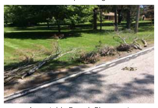
Acceptable Branch Placement

This program runs through approximately October. If a yard project is larger than what the homeowner can do themselves and a contractor does need to be hired, the yard debris must be completely disposed of by the hired contractor per Village ordinances.