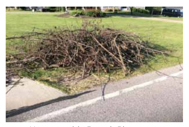
Unacceptable Branch Placement